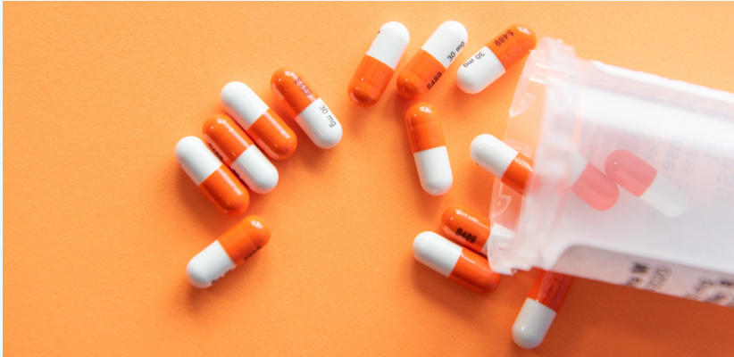
Rhode Island pharmacy price increases driving total health care spending mirrors a national trend. See: https://www.pgpf.org/blog/2019/11/why-are-prescription-drug-prices-rising-and-how-do-they-affect-the-us-fiscal-outlook

The Rhode Island Cost Trends Project, a collaborative partnership between OHIC, the Rhode Island Executive Office of Health and Human Services (EOHHS), Brown University’s School of Public Health, and the Peterson Center on Healthcare, is producing a series of Pharmacy Spotlights to focus attention on pharmacy spending in Rhode Island. These spotlights will also describe the actions the Steering Committee – an advisory body to the project – is taking to address pharmacy spending growth. The first spotlight published in December 2020 showed the degree to which pharmacy price increases have been driving total health care spending in our state.